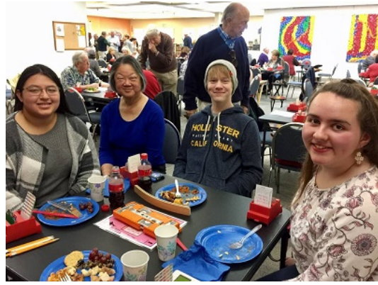
January 21 Unit Potluck Lunch and Game